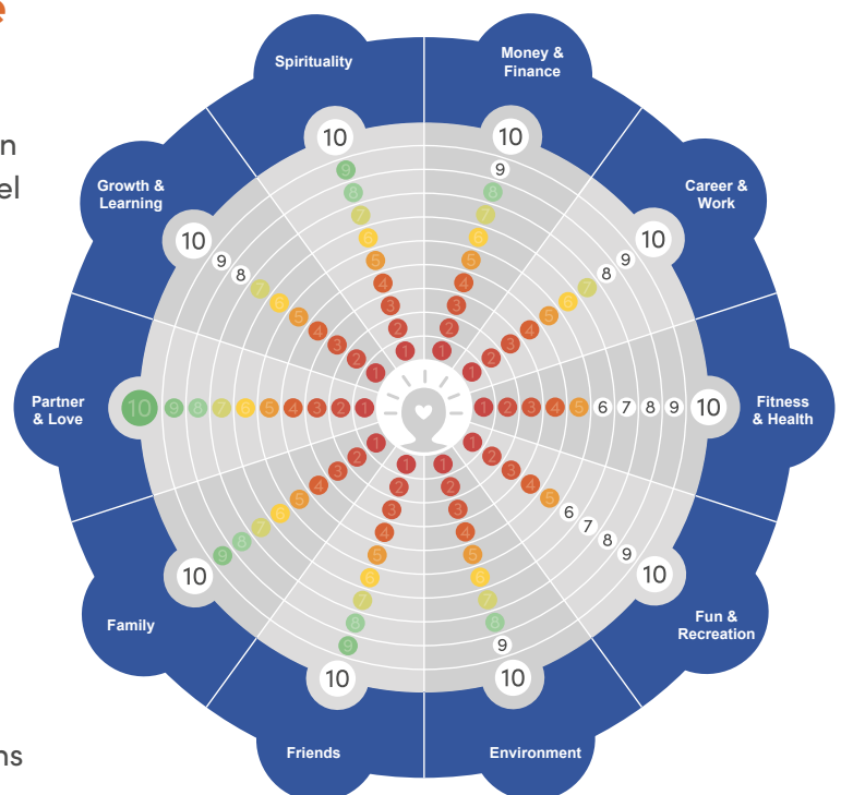
Example of a Wheel of Life

Now give each domain a number to indicate its importance or priority. E.g. rank all domains from 1 onwards where 1 is the domain that is most important to you. Sometimes people have 2 domains that are of equal importance.